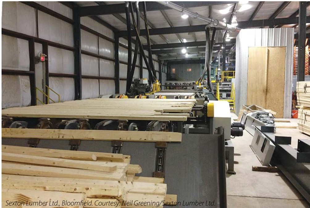
Sexton Lumber Ltd., Bloomfield.